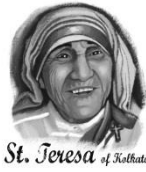
St. Theresa of Calcutta