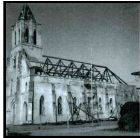
The Old Church coming down. 1969.

The congregation numbers approximately 1,150 households. Weekly Confessions are Saturday evening at 4:30 p.m. Weekend Masses are Saturday evening at 5:30, and Sunday morning at 8:00 and 10:30. The Sunday 8:00 a.m. Mass is broadcast live every Sunday morning over local radio station KHLT - 1520 AM; KYKM – 94.3 FM and KTXM - 99.9 FM.